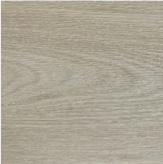
3mm / 5mm