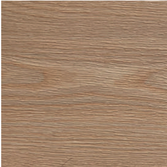
3mm / 5mm