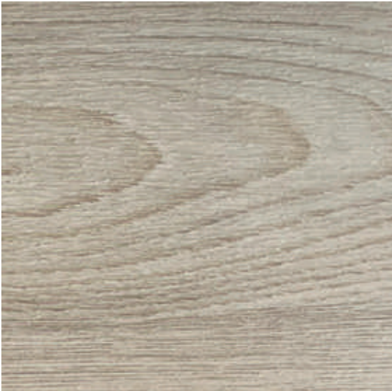
3mm / 5mm