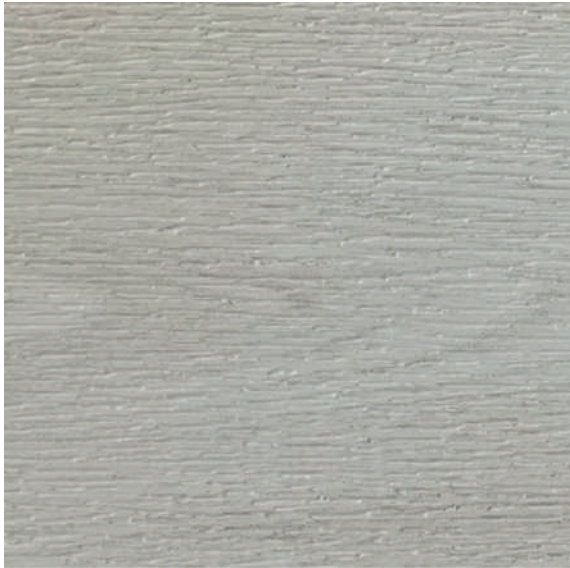
3mm / 5mm